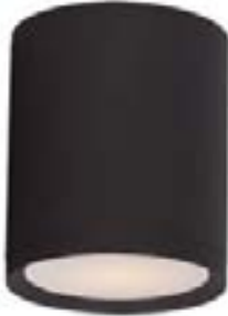
86104ABZ Lightray 1-Light LED Flush Mount