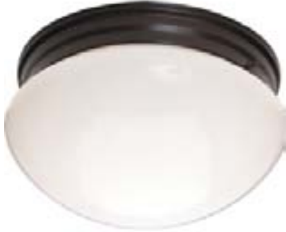
5881WTOI Essentials 2-Light Flush Mount