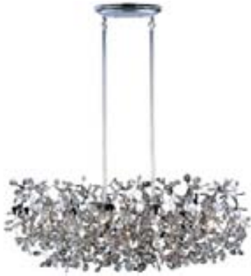
24206BCPC Comet 7-Light Pendant