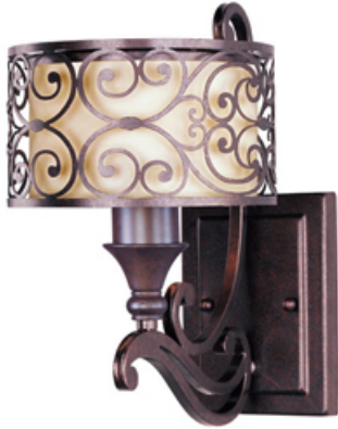
21152WHUB Mondrian 1-Light Wall Sconce