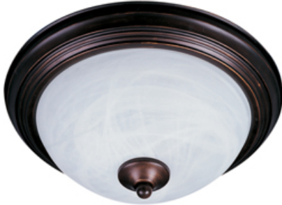
1940MROI Outdoor Essentials 1-Light Outdoor Ceiling Mount