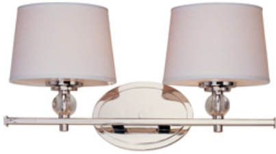
12762WTPN Rondo 2-Light Bath Vanity