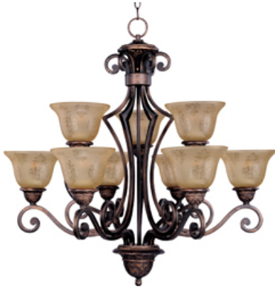
11245SAOI Symphony 9-Light Chandelier