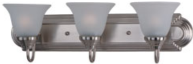
8013FTSN Essentials 3-Light Bath Vanity