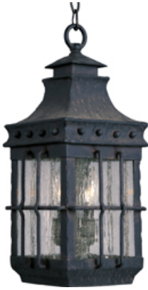
30088CDCF Nantucket 3-Light Outdoor Hanging Lantern