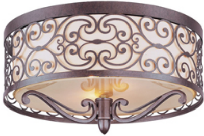
21151WHUB Mondrian 2-Light Flush Mount