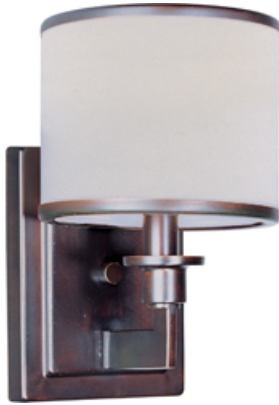
12059WTOI Nexus 1-Light Wall Sconce